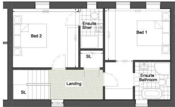
Plot 3 First Floor Plan